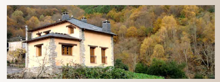
You can book the accommodations in this guide in JUST ONE STEP