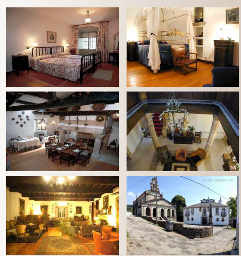
You can book the accommodations in this guide in JUST ONE STEP