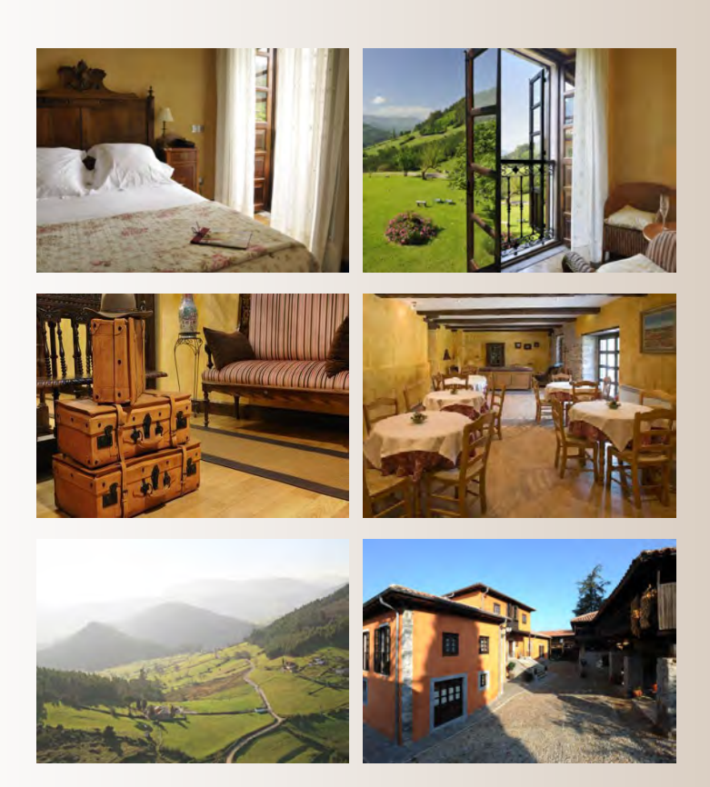
You can book the accommodations in this guide in JUST ONE STEP